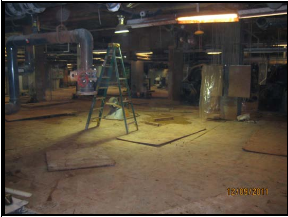
Basement Micro-Pile Installation