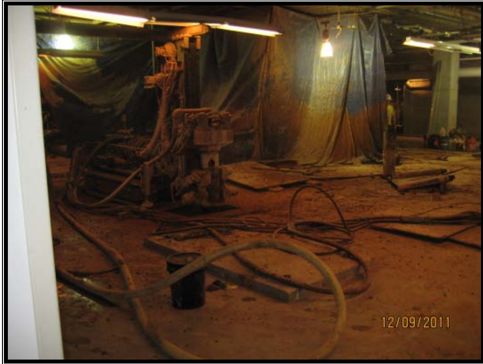
Basement Micro-Pile Drilling