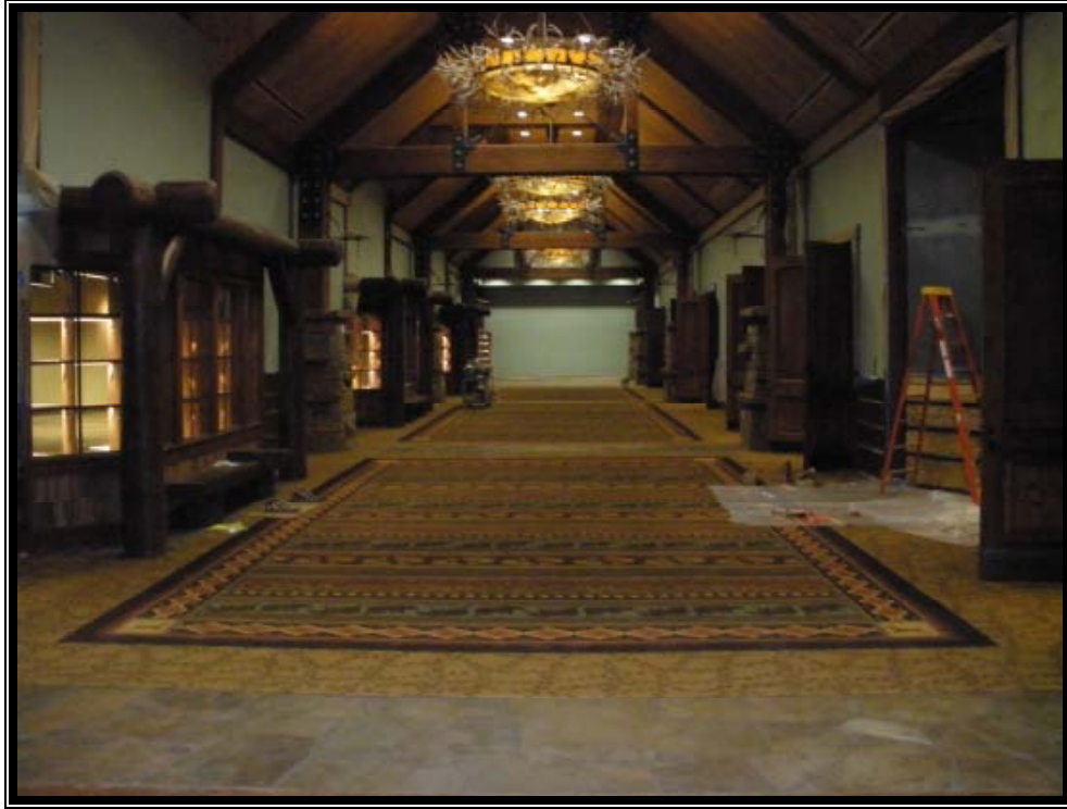
Snapshot of Prefunction E136