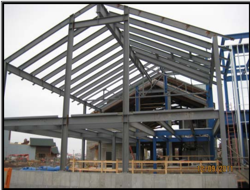
Back of House Structural Steel