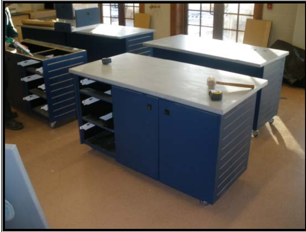
Installation of Mobile Lab Tables in Outdoor Lab E163