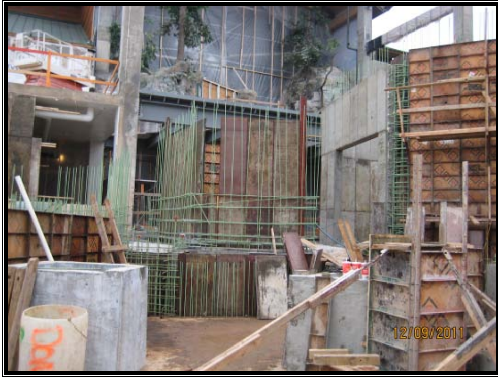
Waterfall Pit Wall Forms