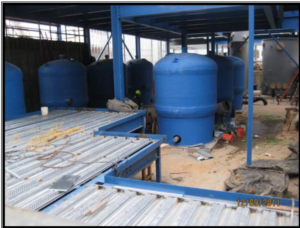
Back of House FRP Tanks and Metal Decking