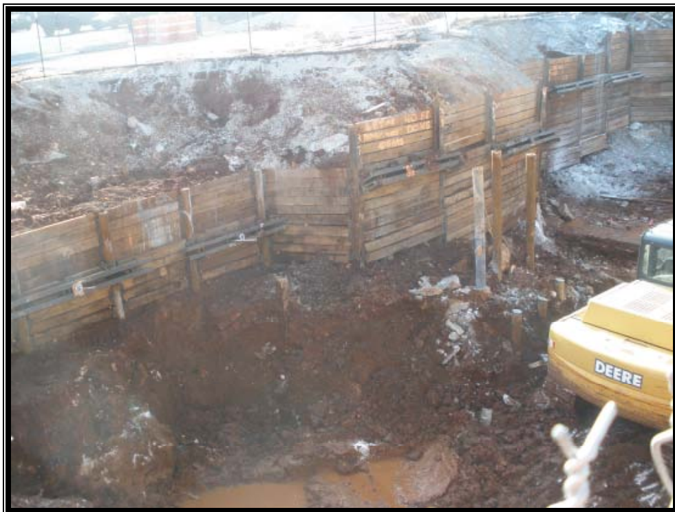
Snapshot of Connector Excavation