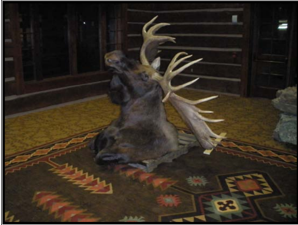
Moose to be installed Above Multipurpose Room E103 Fireplace