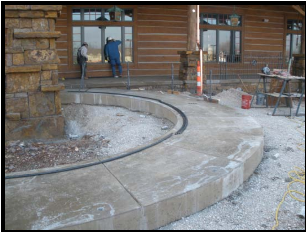
Installation of Handicap Ramp Railing