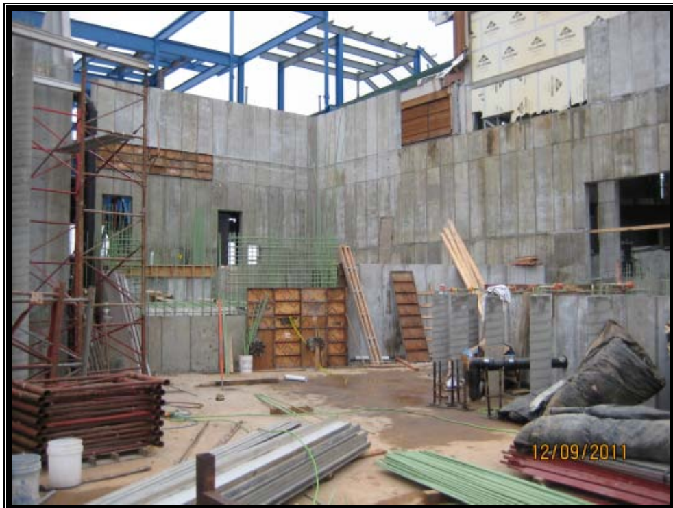
Swamp Shack and Beaver Exhibit Concrete Walls