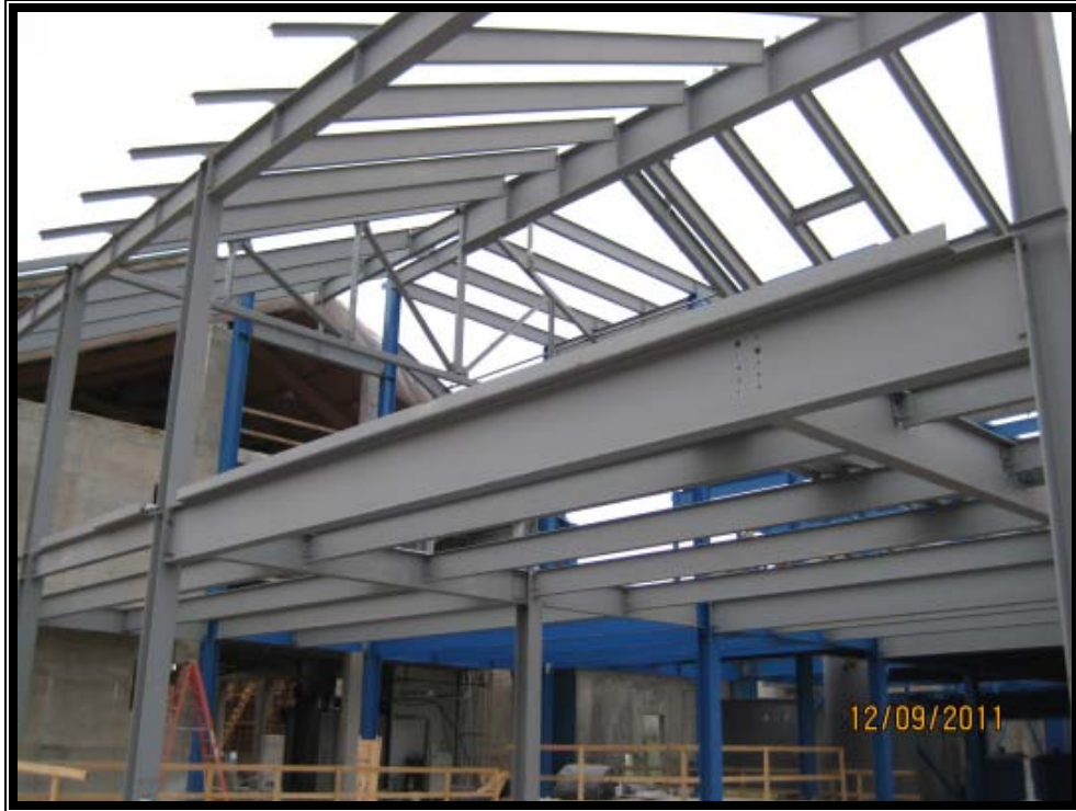
Back of House Structural Steel