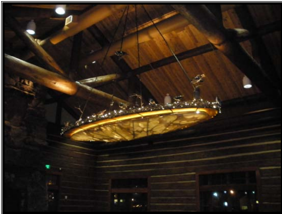
Installation of Rawhide Dome in Multipurpose Room E103