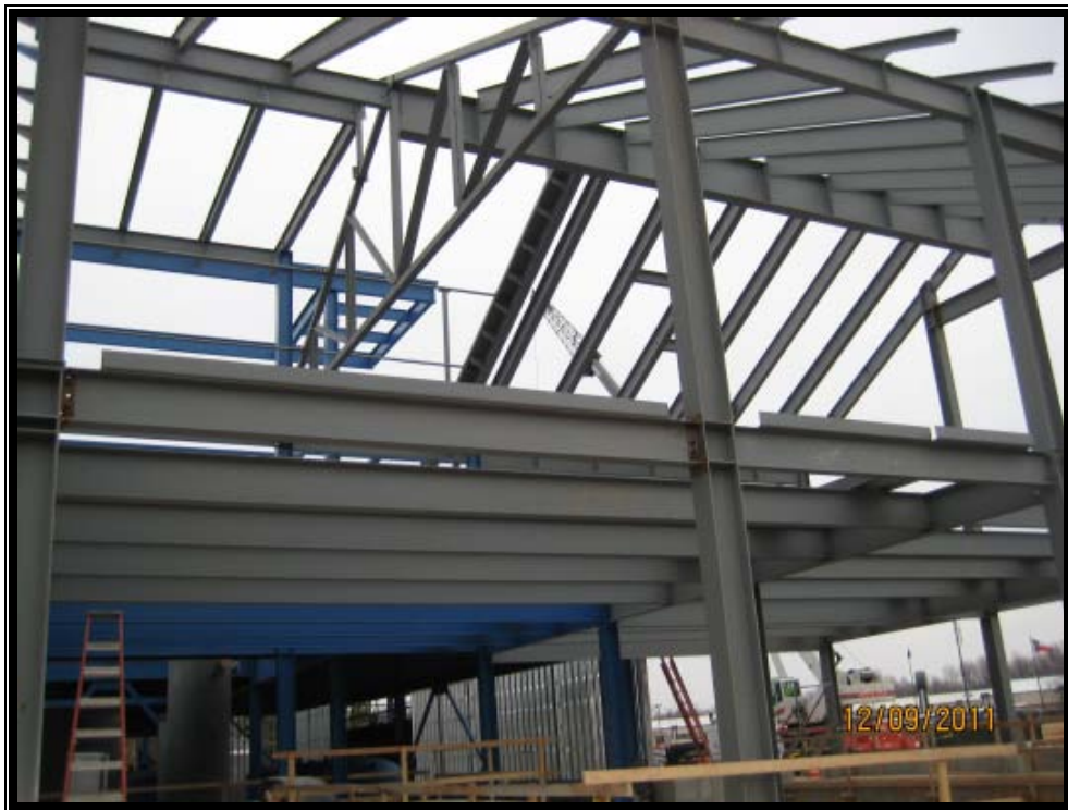
Back of House Structural Steel