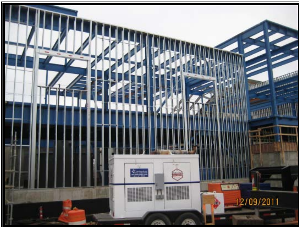
Back of House Steel Studs