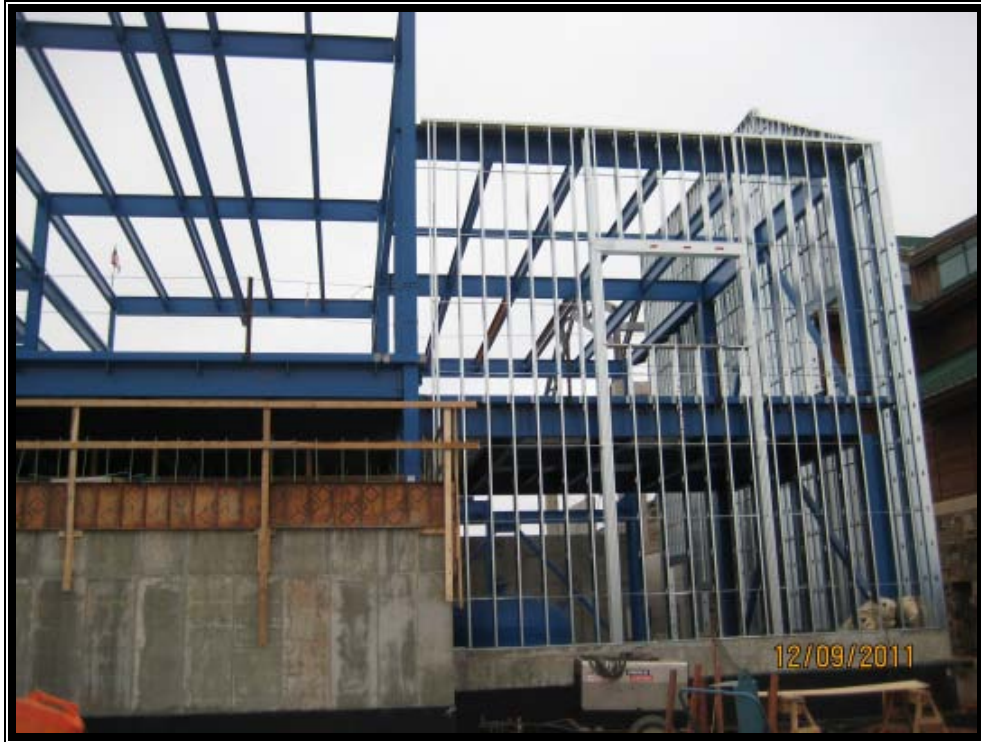
Back of House Structural Steel/Studs