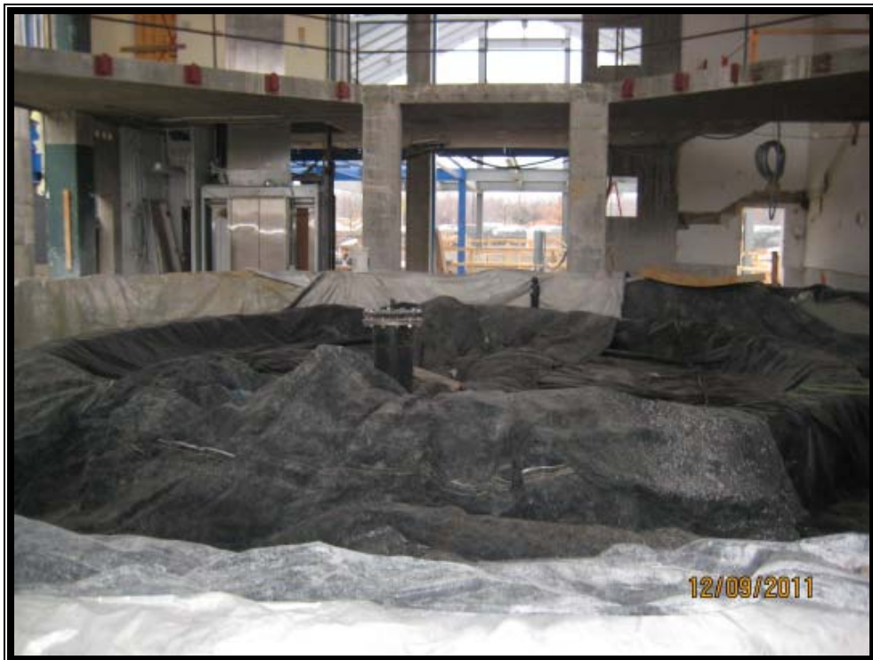
Concrete Cure Blankets Over Stingray Tank Foundation