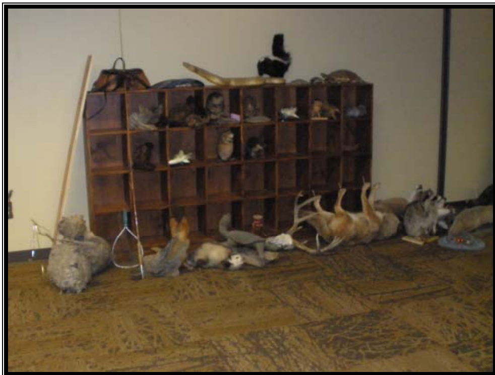
Snapshot of Taxidermy to be Themed Throughout the Expo/CEC