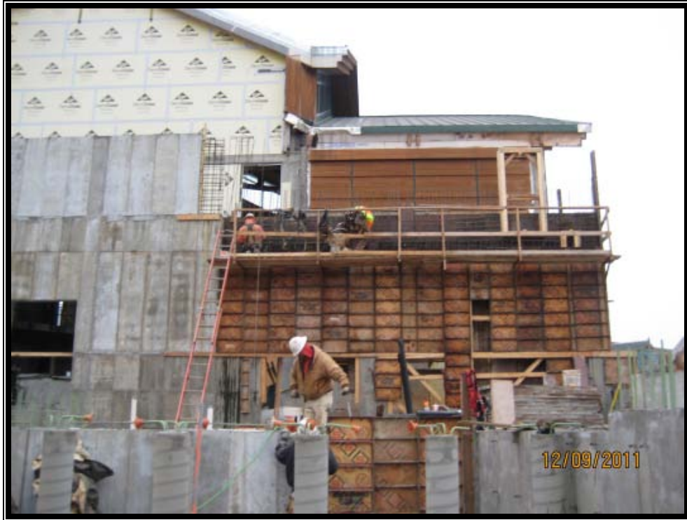
South Concrete Wall Forms