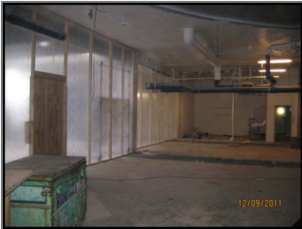
Temporary Heat Enclosure