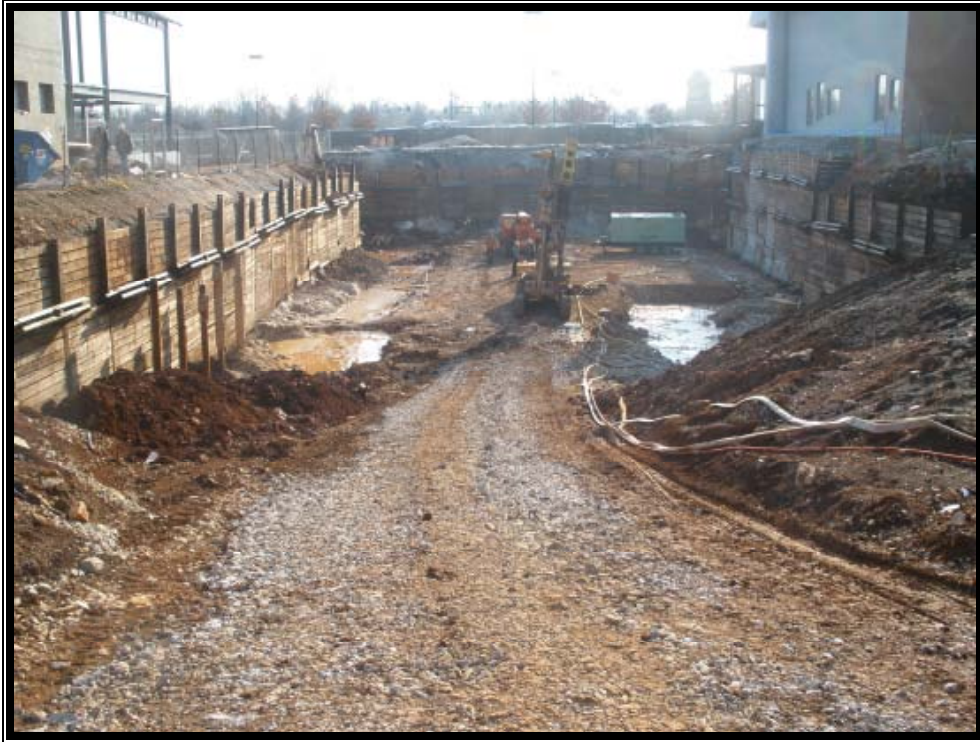
Snapshot of the Connector Excavation