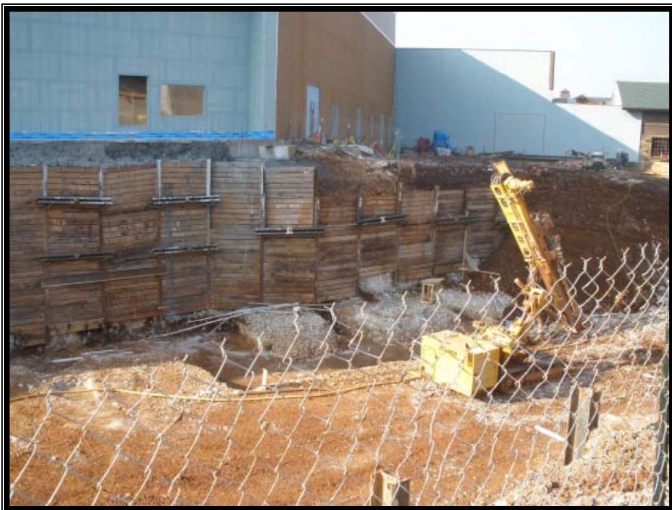
Snapshot of Connector Excavation