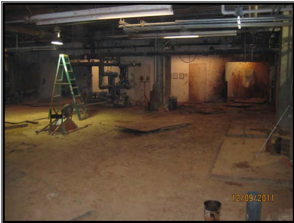
Basement Micro-Pile Installation