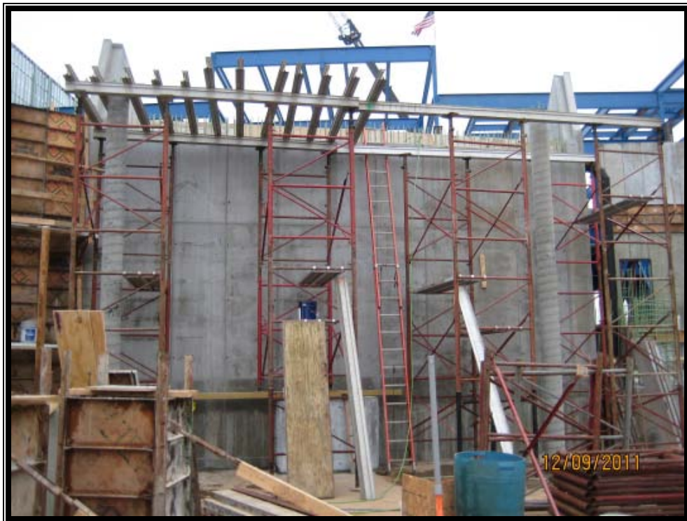
1316' Floor Slab Scaffolding