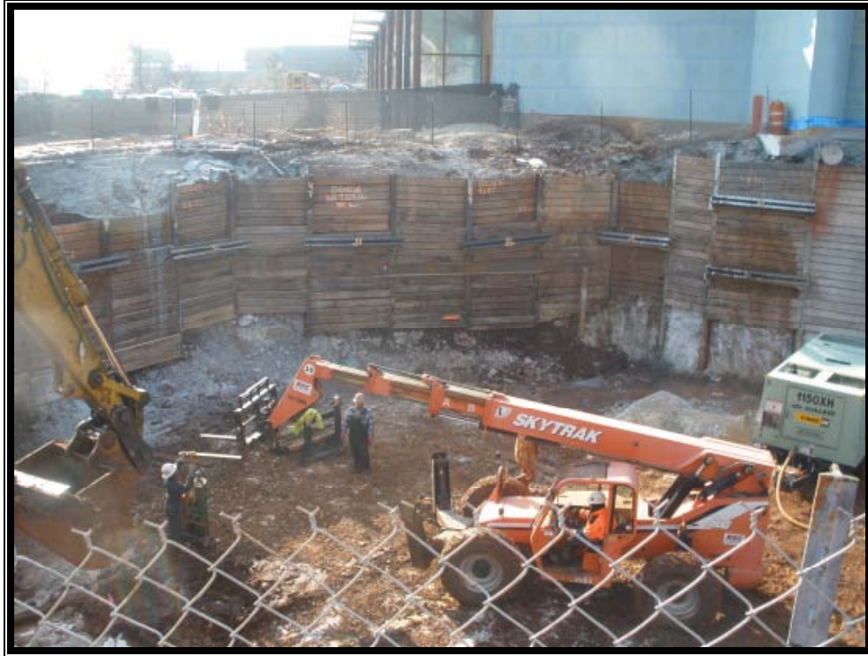
Snapshot of the Connector Excavation