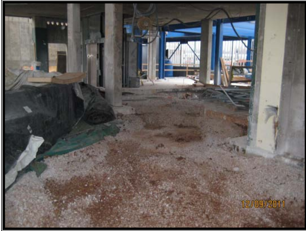
Interior Slab Demolition