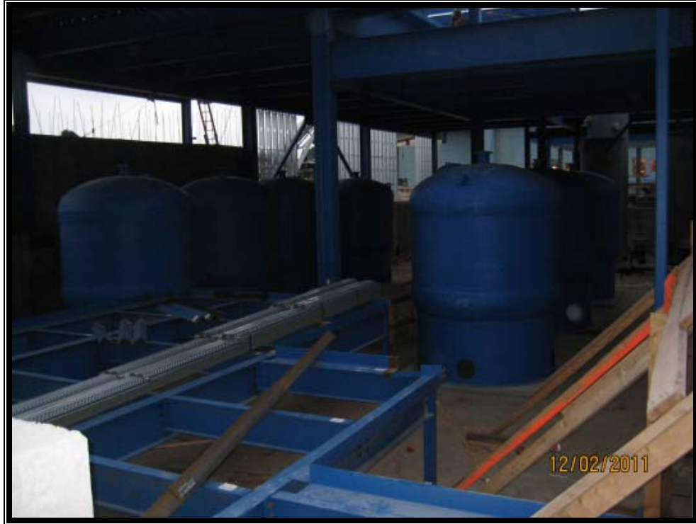
Back of House Snap Shot