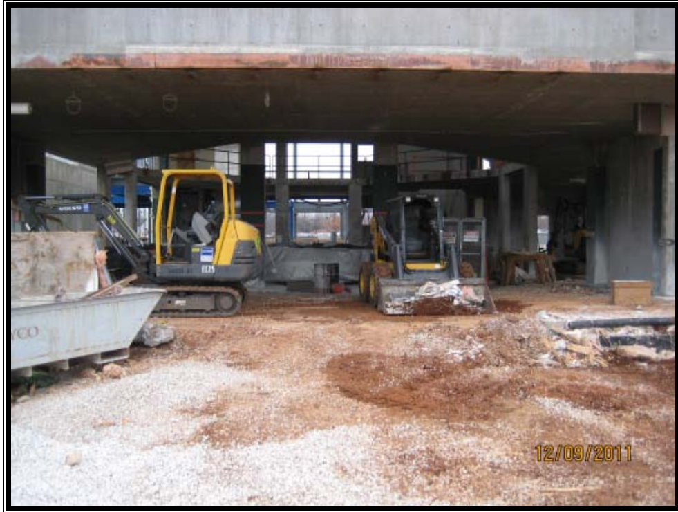
Front of House Snap Shot