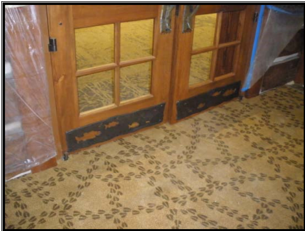
Installation of Door Kick Plates