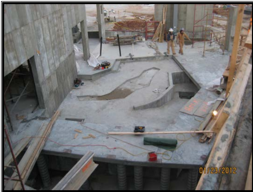
Flamingo Walkway Snap Shot