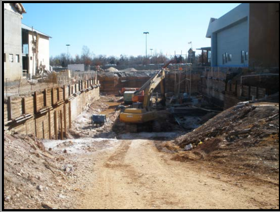
Snapshot of the Connector Excavation