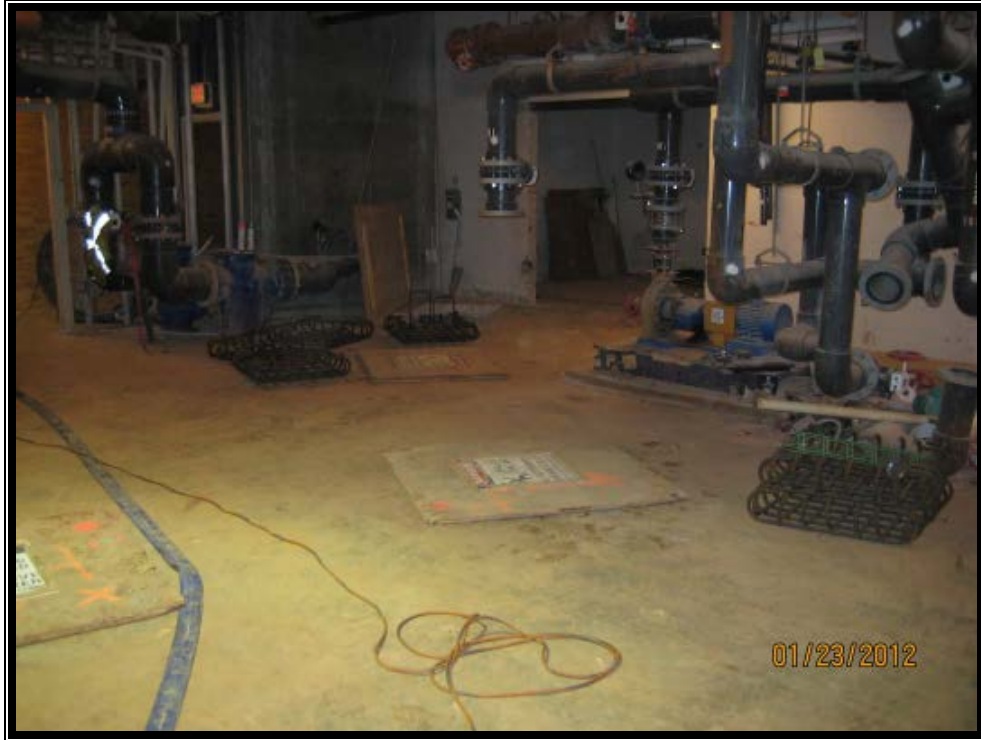
Basement Micro-Pile Rebar Cages