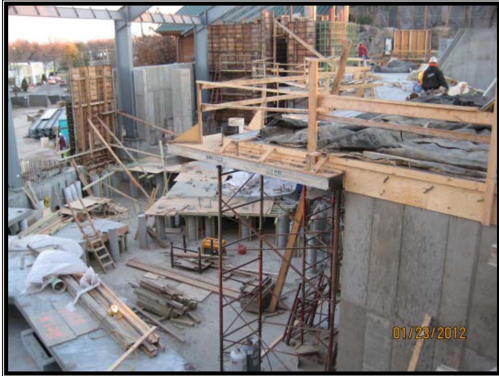
Front of House Snap Shot