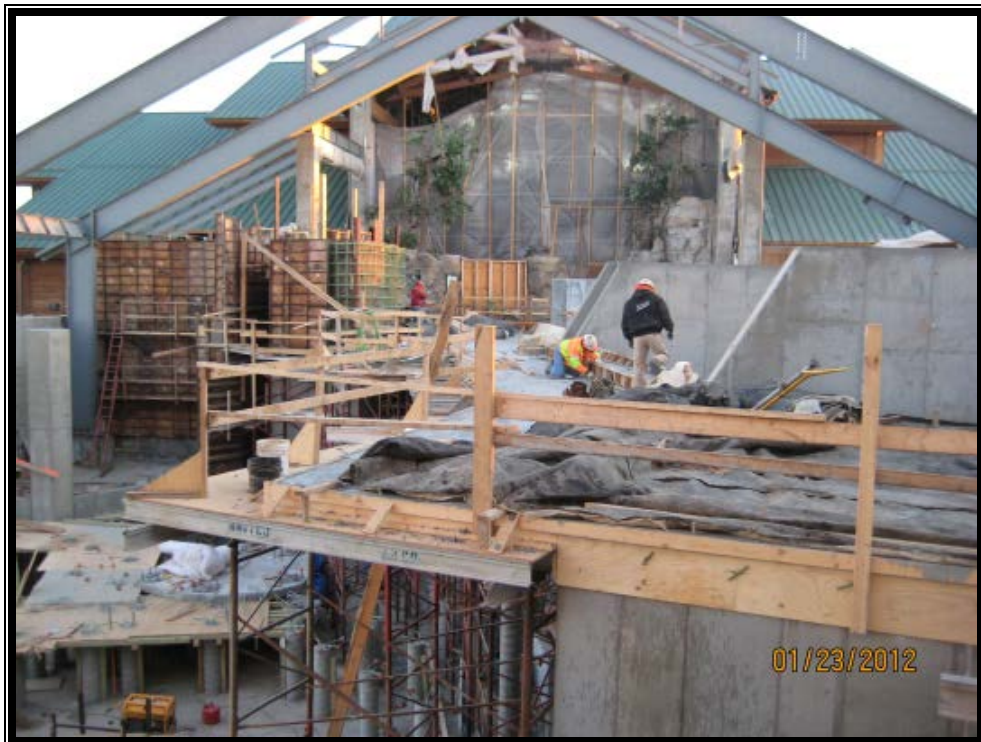
1316' Elevated Slab