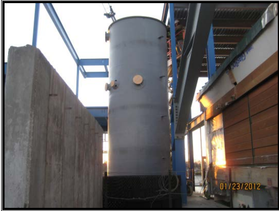
Back of House FRP Tank