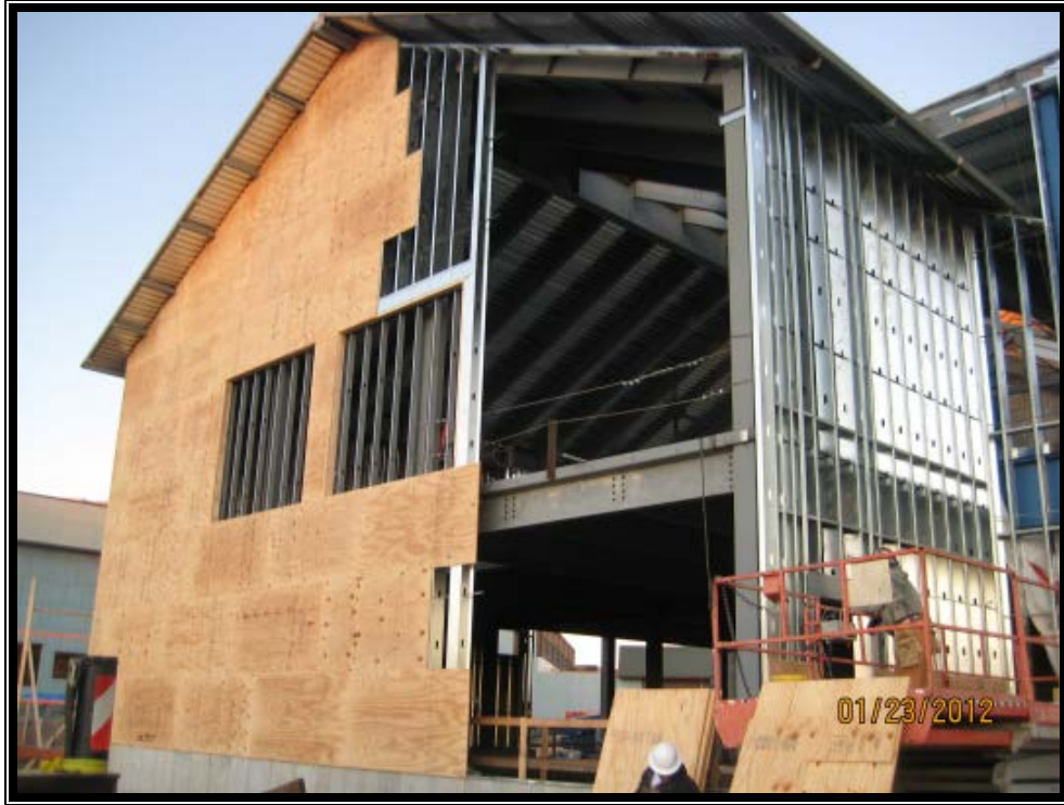
BOH Exterior Sheathing/Studs