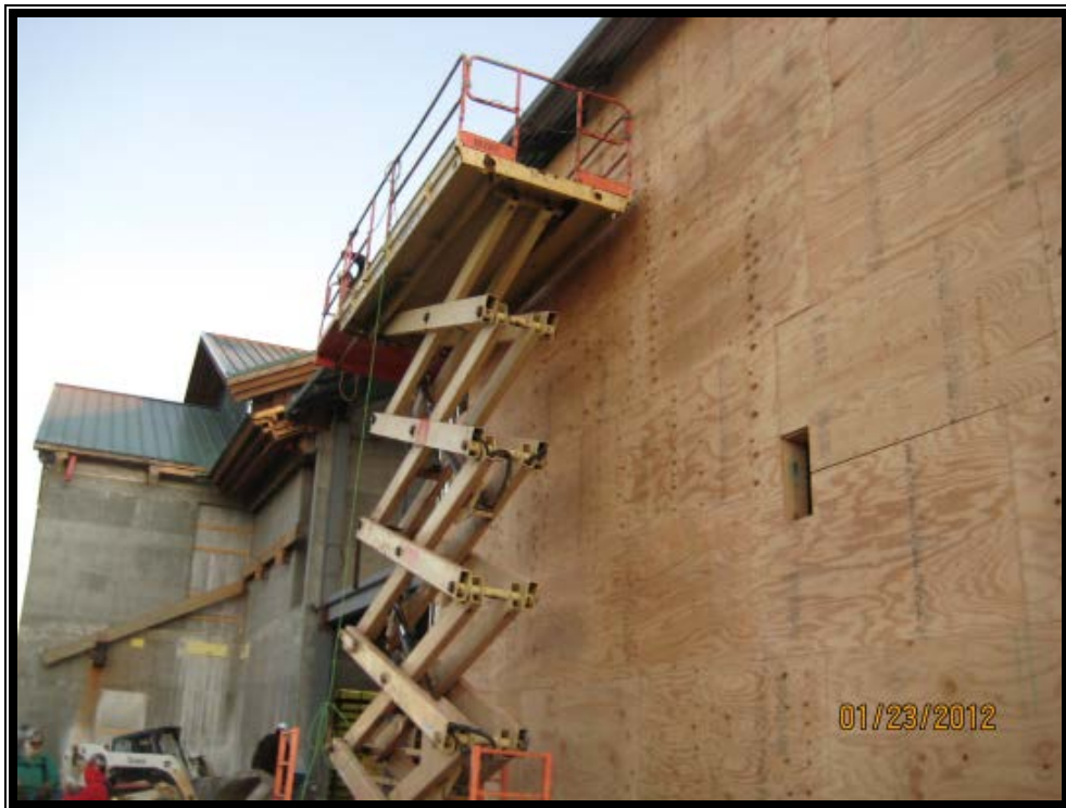
West Side Exterior Sheathing