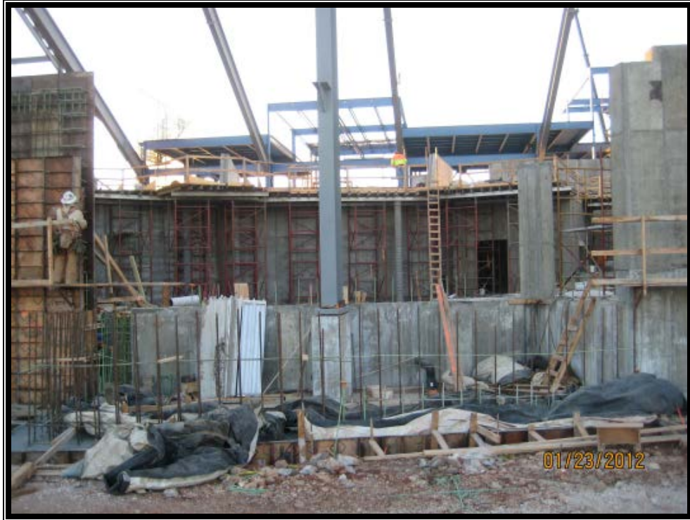
Front of House Snap Shot