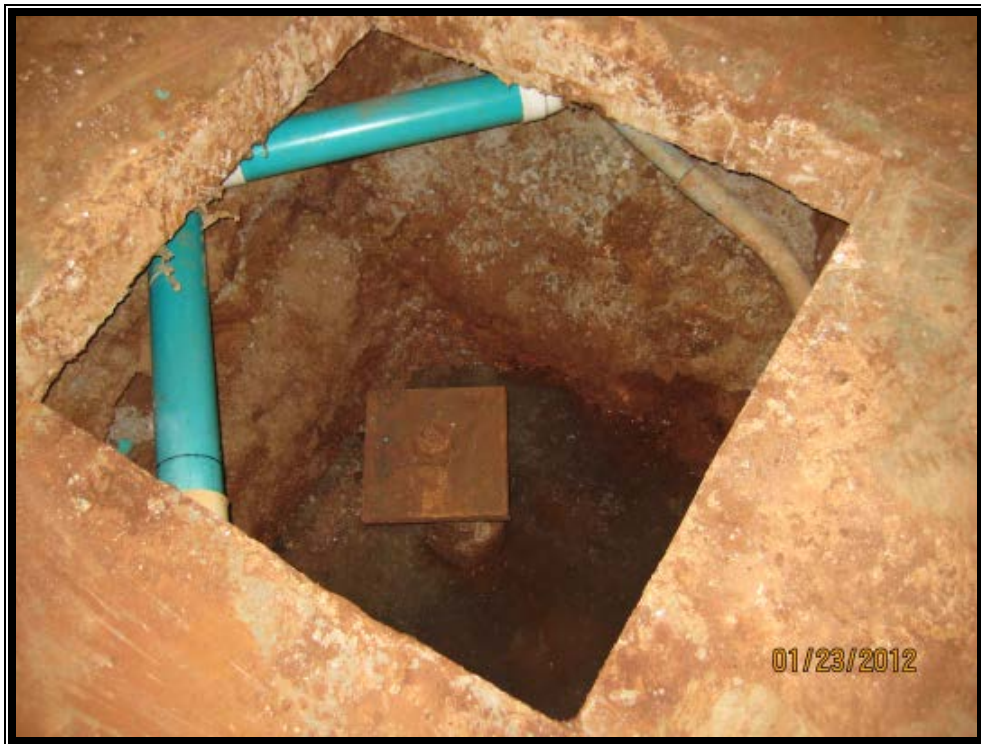
Basement Micro-Pile Pipe and Conduit Repair