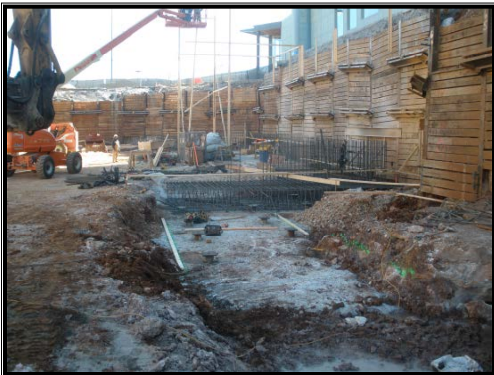
Installation of Concrete Footing