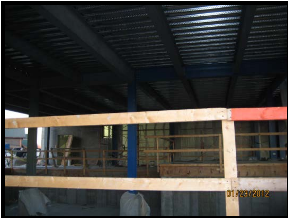
Back of House Structural Steel/Metal Deck