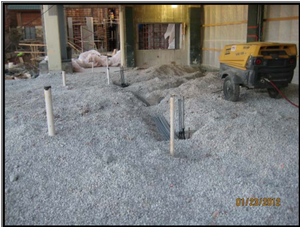
Front of House Underground Plumbing/Electrical