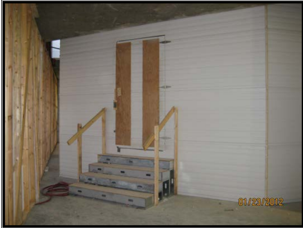
Stingray Tank Temporary Enclosure