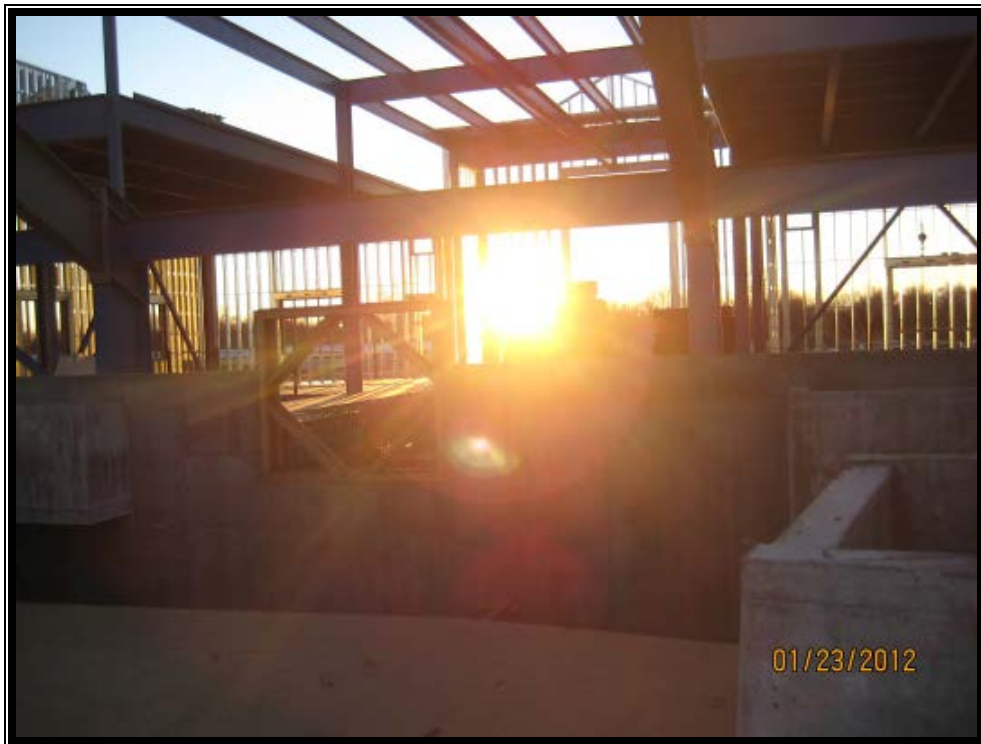
Back of House 1318' Snap Shot