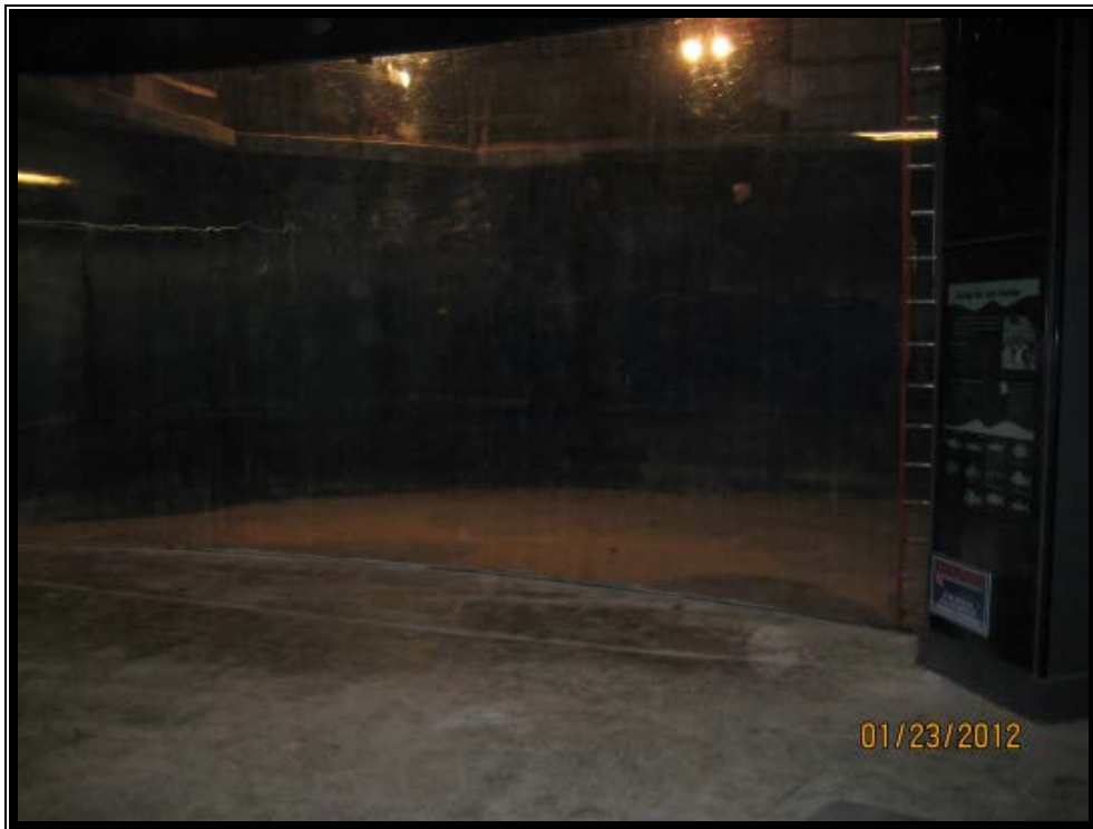
Out to Sea Acrylic Polishing