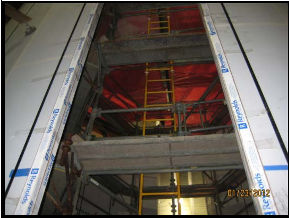
Scaffolding for Stingray Tank Acrylic Bonding