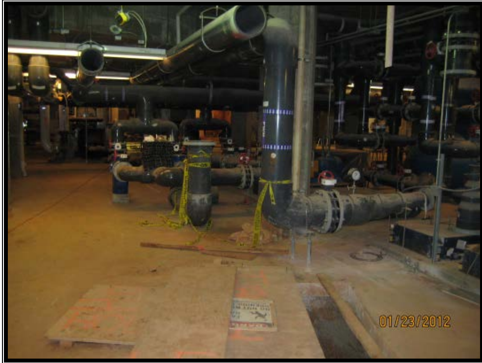
Basement Micro-Pile/LSS Snapshot